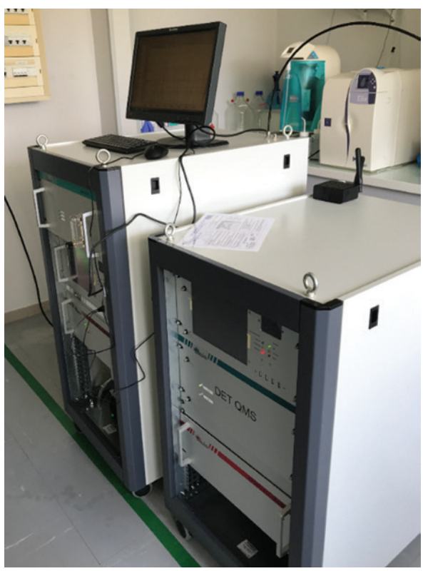
GCMS system at National Institute

Chromatotec has hardened and automated a complete GCMS system composed by two different automatic trap GC-FIDs and one single process Quadrupole MS