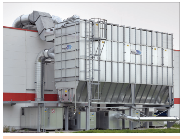
Pic 1. Medium Size Bag Hoses Filter

The retention of particulates, no matter if they are carried in an exhaust gas stream or are a valuable product in a drying process, is covered by modern filtration technology. Beside more exotic principles like electrostatic precipitators or wet scrubbers, a vast range of applications where particulates are carried by a dry gas stream are retained by so called 'dust collectors' these days. (Pic 1) These dust collectors, which are also called 'bag houses' or dust filters, have gone through an impressive evolution over the past decades and have reached incredibly effective retention rates and thus very low particle emission levels downstream.