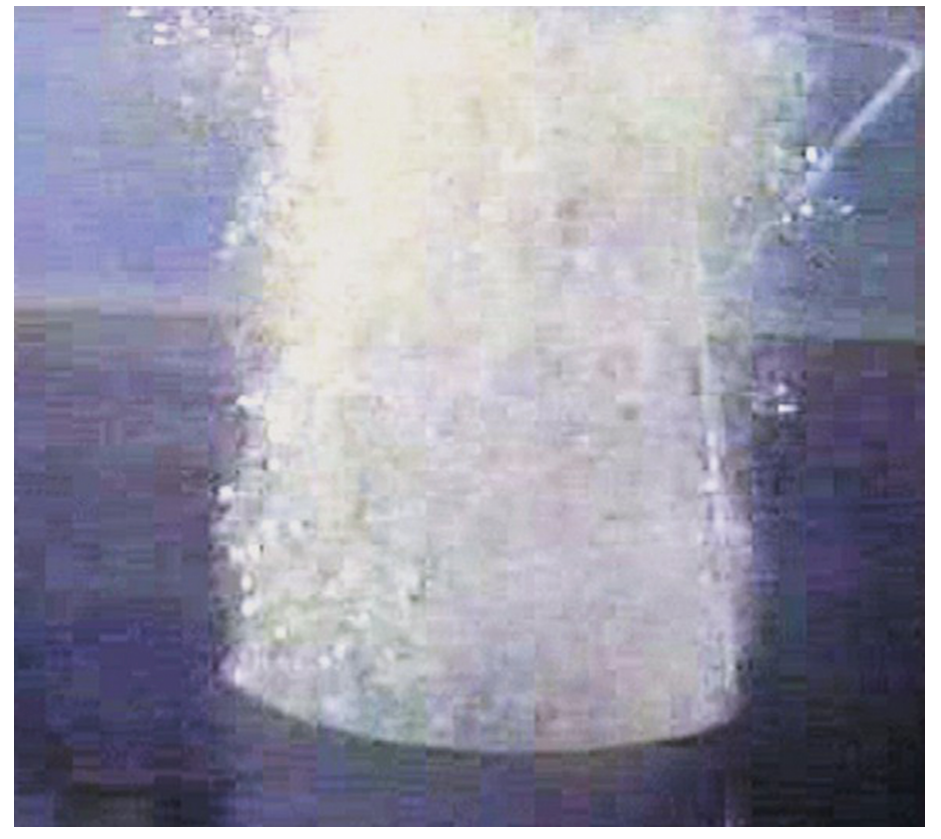
Bed View 2 of Aquaerators at Craigshead

Many of these devices, however, due to their design, are only able to affect a relatively small cubic volume of water, so large numbers of them must be deployed to aerate a lake adequately. Initial